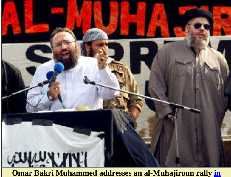
Omar Bakri Muhammed addresses an al-Muhajiroun rally <u>in</u> <u>Trafalgar Square</u>, London (Abu-Hamza, right)

The British Government ran a 'Covenant Of Security' with radical Islamic groups like Al-Muhajiroun leaving them free to recruit for terrorist missions abroad as long as they did not attack targets in Britain. During the 1990s British intelligence used al-Muhajiroun to carry out attacks against Serbia as part of strategy to dismember the former Yugolsavia. Al-Muhajiroun withdrew from the covenant following the Anglo-American invasion of Iraq in 2003, leaving it free to support attacks on the United Kingdom such as those carried out in July 2005.